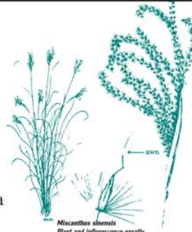
Miscanthus sinensis Plant and inflorescence greatly reduced; spikelet x 5

quickly develops into a bushy plant in the garden. The fine-textured, airy flowerheads are produced in late summer and turn a warm, glowing wheat color in winter. Should be cut back in early spring. Prefers full sun. Many different foliage and flower forms of switchgrass are available.